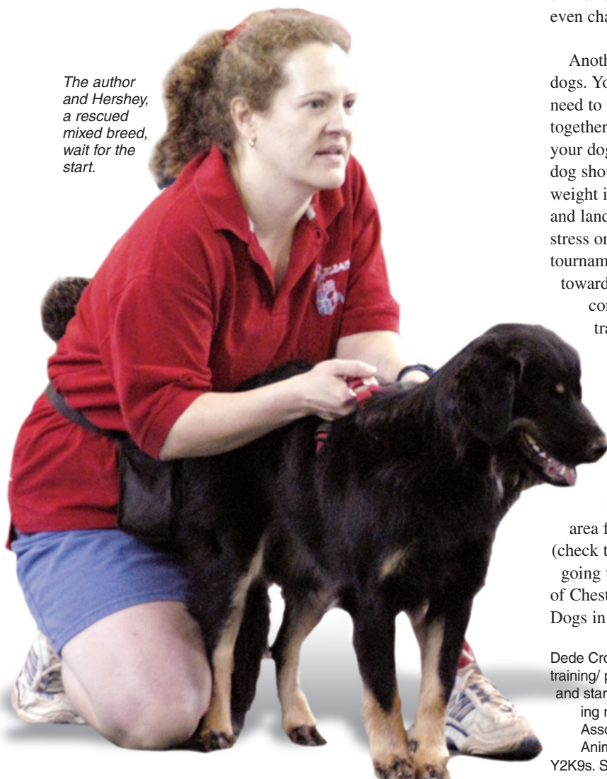
The author and Hershey, a rescued mixed breed, wait for the start.