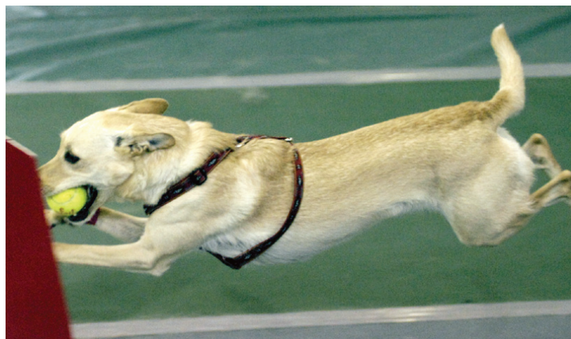
Ola, a rescued mixed breed, demonstrates how to fly with a ball.

A typical flyball team is three border collies (fast dogs) and a Jack Russell terrier (short dog to keep the jump height low). But there are plenty of teams that don't have any border collies on them. NAFA developed two separate classes of racing to encourage people to race dogs other than the usual types. One is Regular, in which any four dogs can run together. The other is Multi-breed, in which all four dogs running have to be different breeds (or one can be a mixed breed). Thus you might have a Multi-breed team of a border collie, golden retriever, hound dog mix, and miniature poodle.