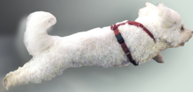
Riley, a bichon frise, takes off!