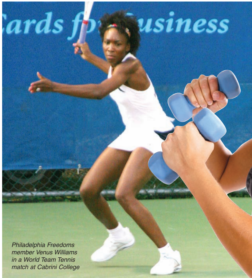
Philadelphia Freedoms member Venus Williams in a World Team Tennis match at Cabrini College